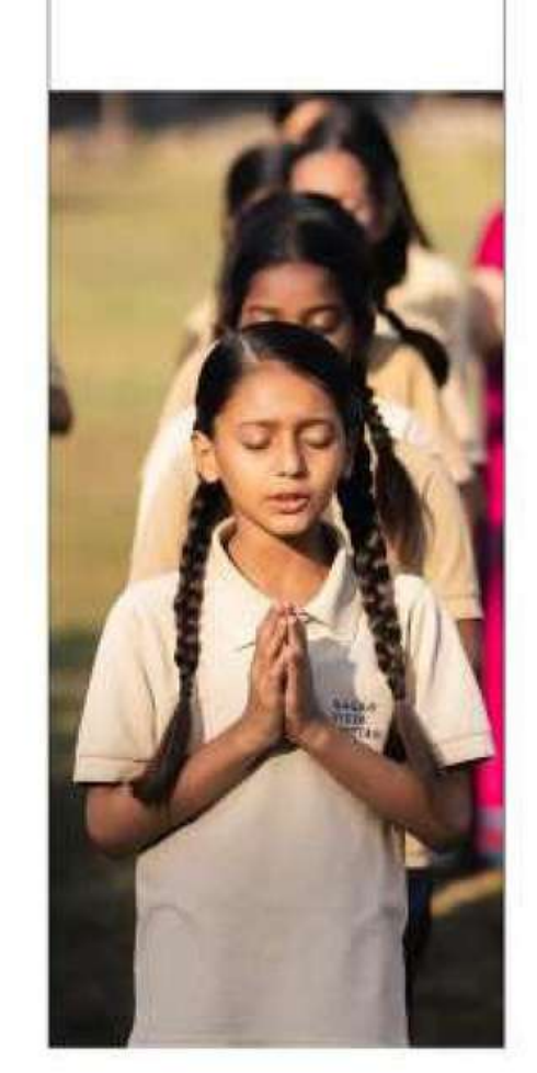
Commited to provide free education to 1500+ students