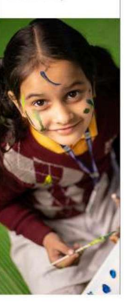
Hightly regarded techno-skill education hub in Bhopal