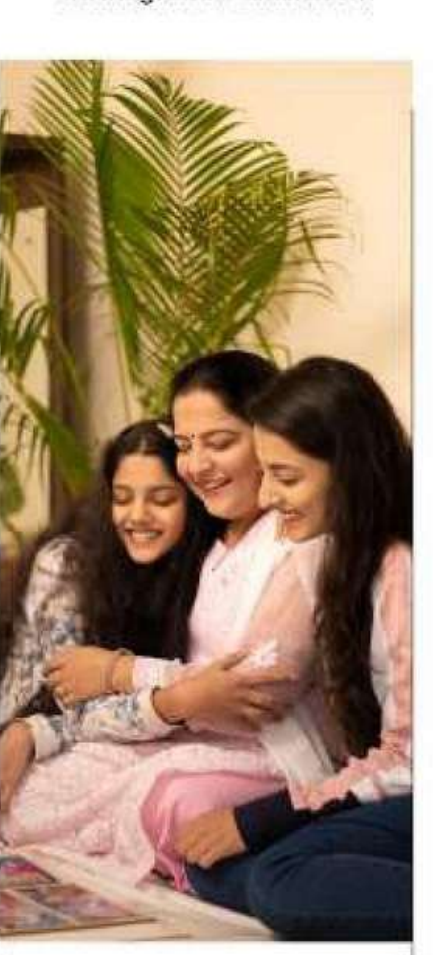
Leading Real Estate with 40 Years Experience